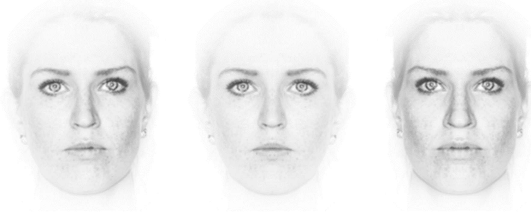
Figure 2. Laterality effects in face perception have been measured by face chimeras. Here, the left and right parts of an original face (author HMS) were used to make two chimeric faces, one from the left half-face image and one from the right. Humans and some animals tend to choose a left rather than a right chimera as being similar to an original full face.