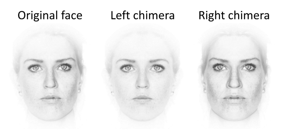
Figure 2. Laterality effects in face perception have been measured by face chimeras. Here, the left and right parts of an original face (author HMS) were used to make two chimeric faces, one from the left half-face image and one from the right. Humans and some animals tend to choose a left rather than a right chimera as being similar to an original full face.